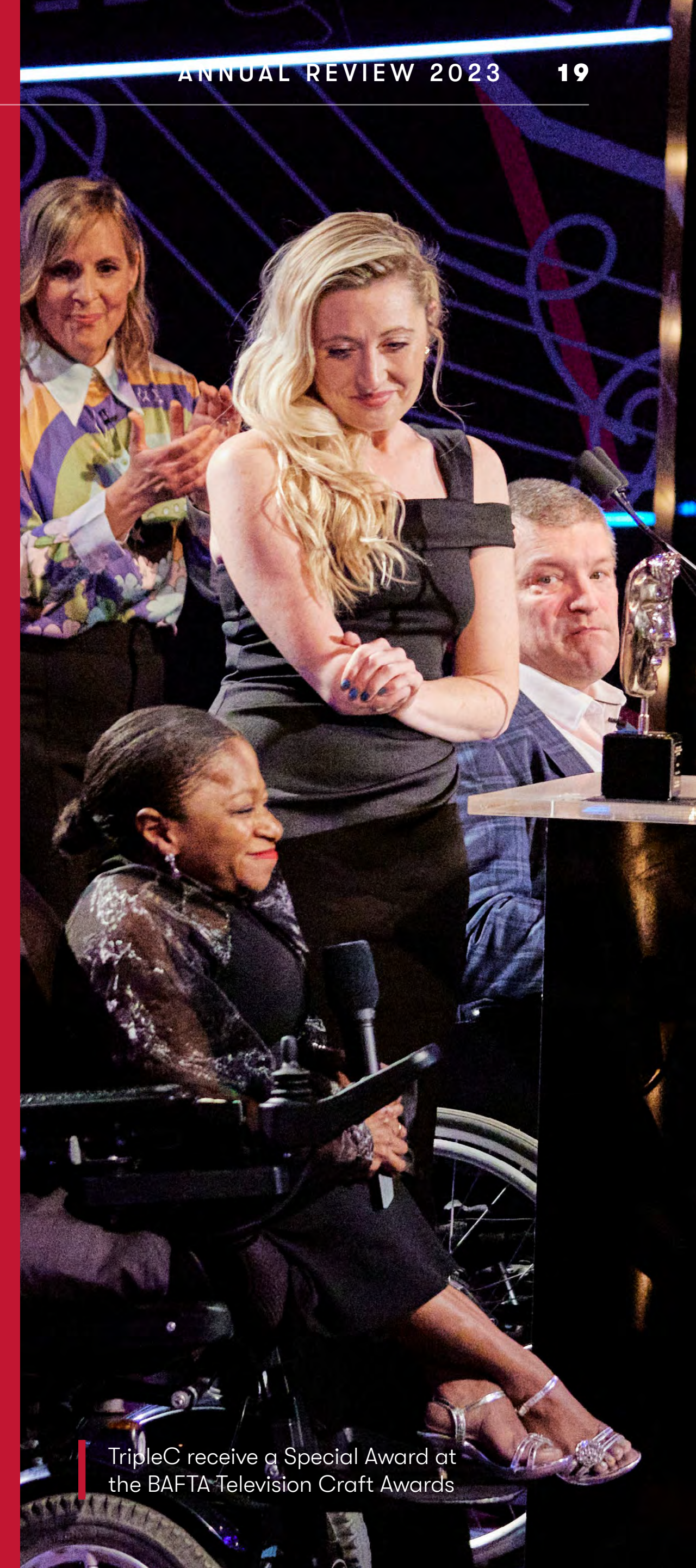
TripleC receive a Special Award at the BAFTA Television Craft Awards

She said: "Our industry is changing for the better, and we can't wait to fully show the world the talent that's in it. The recognition from BAFTA will support our drive for change and help ensure accessibility and inclusivity is high up on every agenda."