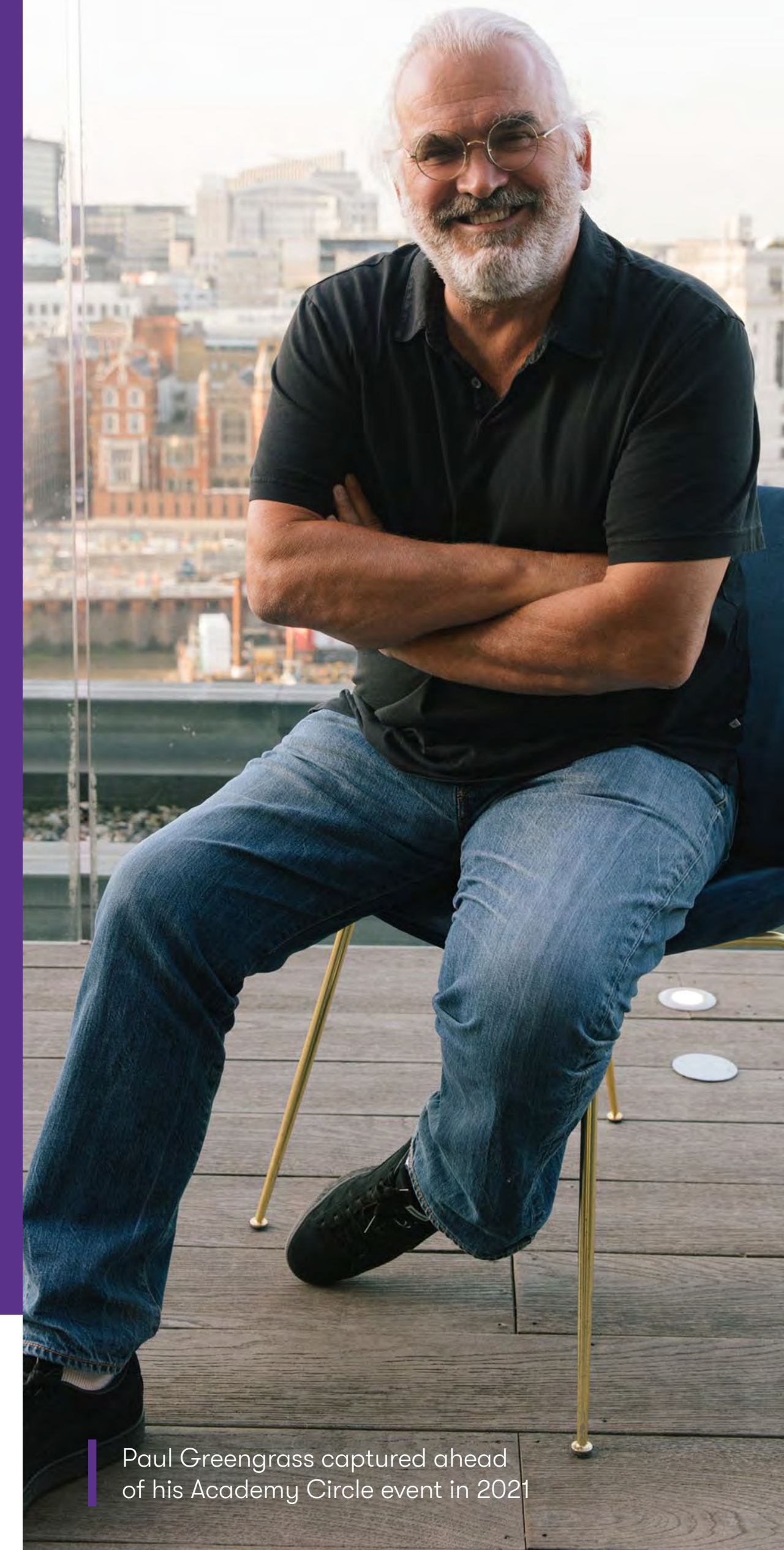
Paul Greengrass captured ahead of his Academy Circle event in 2021

Summary financial information included within this report is taken from BAFTA's audited consolidated financial statements for the period ending 31 December 2022. The full financial statements are presented in BAFTA's Annual Report & Accounts for 2022, which are available on our website and from Companies House pursuant to legislation.