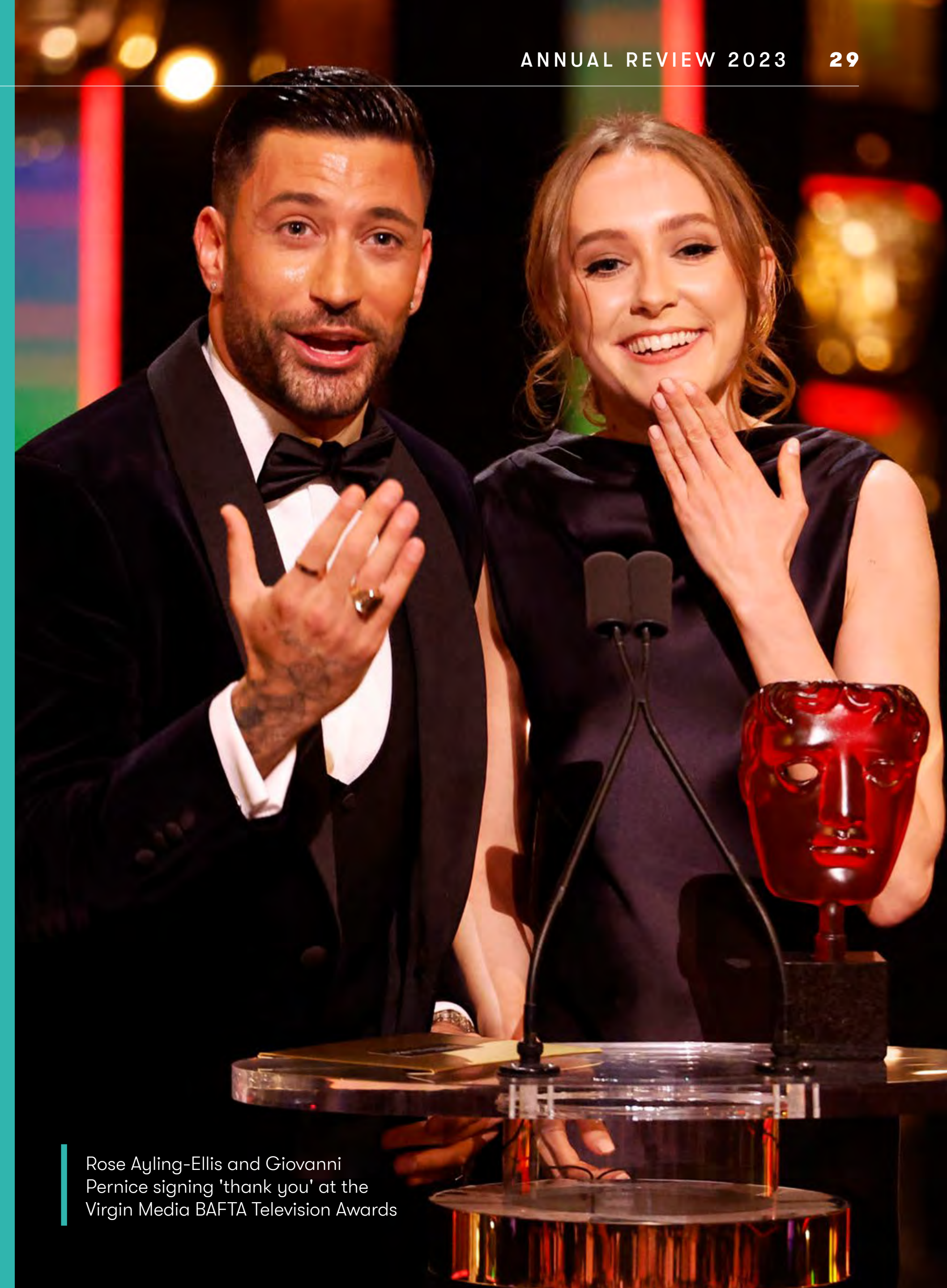
Rose Ayling-Ellis and Giovanni Pernice signing 'thank you' at the Virgin Media BAFTA Television Awards