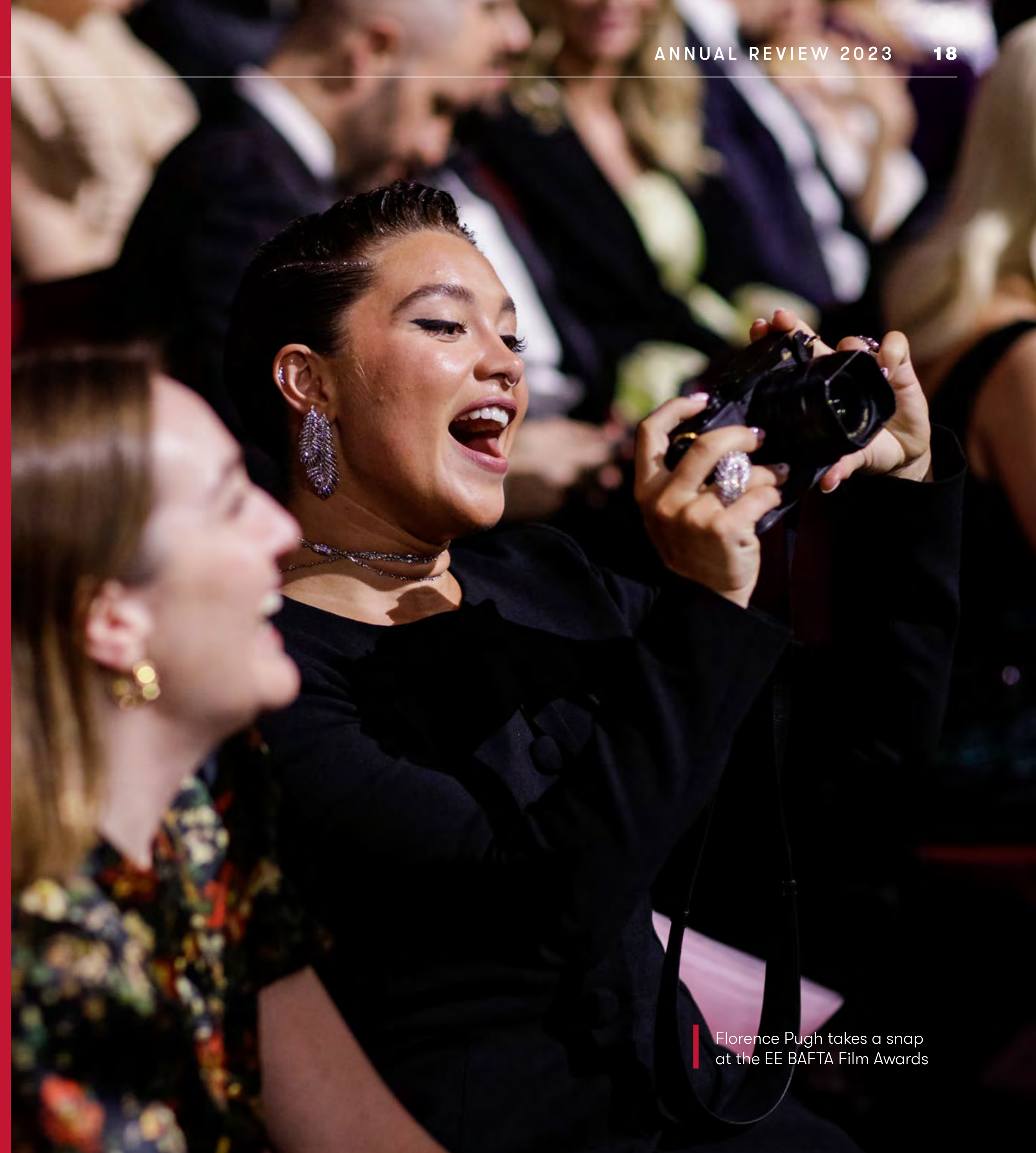
Florence Pugh takes a snap at the EE BAFTA Film Awards

In 2022, a space for nominated games' download codes to be accessed by members was added to BAFTA View for the first time, in preparation for the 2023 Games Awards. Also in 2022, our nations and regions' awards entries were hosted on BAFTA View for the first time, and an Amazon Fire TV Stick app was launched to complement the existing web app.