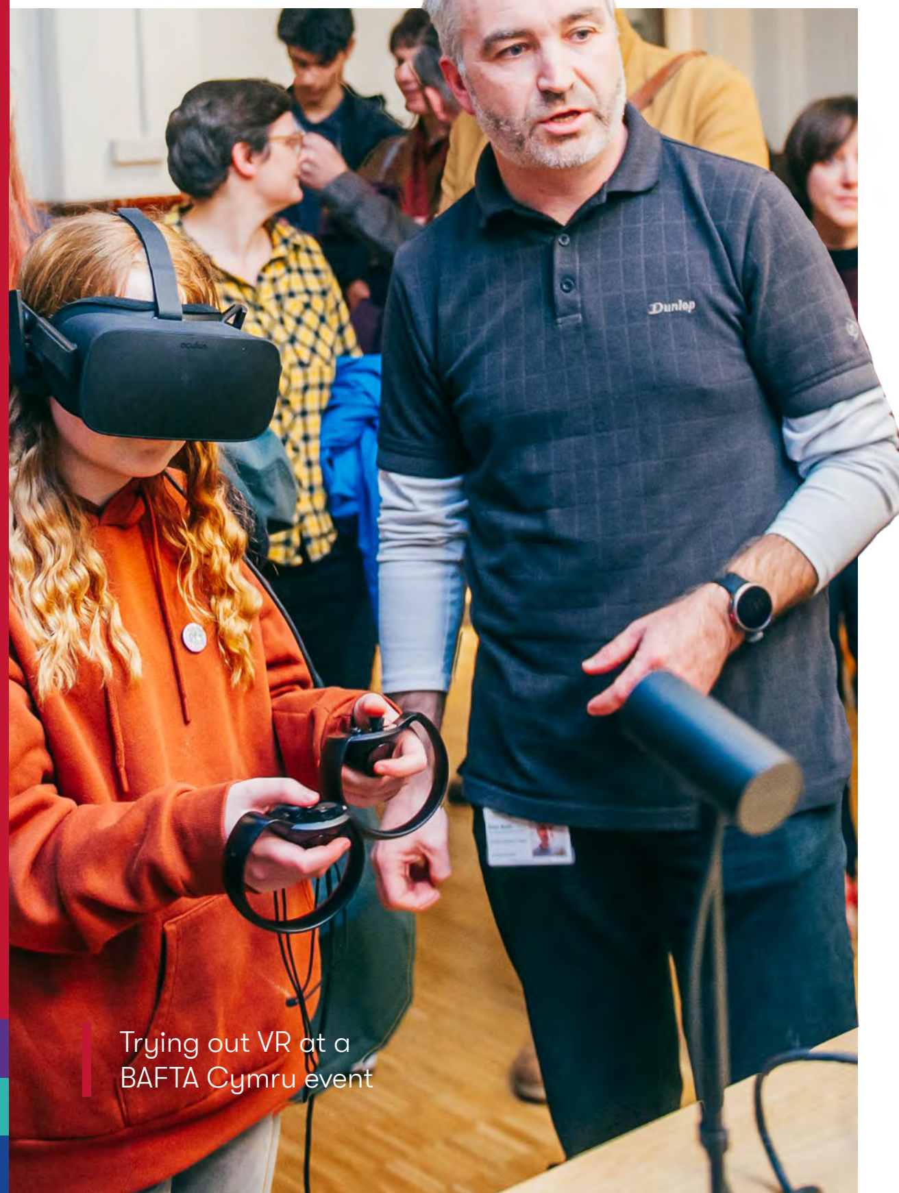
Trying out VR at a BAFTA Cymru event

Children and young people are among the most creative people on the planet. From weekend family festivals to our long-running BAFTA Young Game Designers programme, we are finding imaginative and inspiring ways to encourage children to express themselves and discover more about creative careers. Not only does this help children and young people build confidence, self-esteem and skills, it is nurturing the films, games and TV makers of the future.