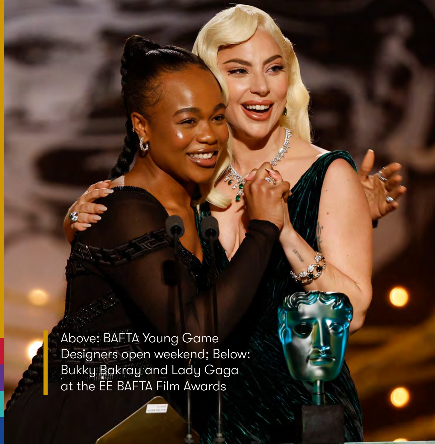
Above: BAFTA Young Game Designers open weekend; Below: Bukky Bakray and Lady Gaga at the EE BAFTA Film Awards