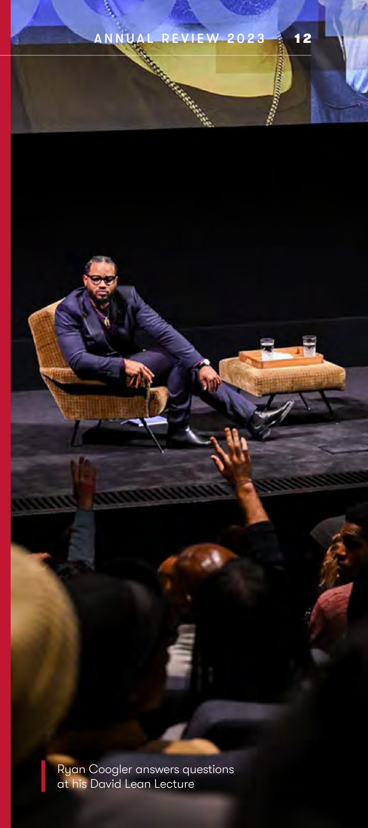
Ryan Coogler answers questions at his David Lean Lecture

The private hire of spaces at BAFTA 195 generates significant year-round revenue that directly funds our work as a charity: in 2022, we played host to 635 events, just under 40% of which were commercial hires. Along with income from the members' space, our operations generated revenue of £5m, creating a £1.8m profit that goes back into funding our year-round charitable work.