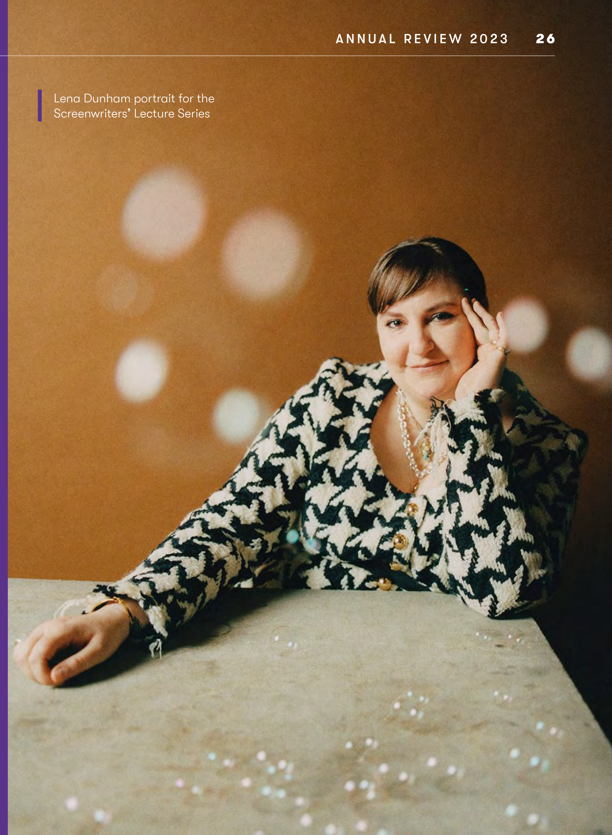
Lena Dunham portrait for the Screenwriters' Lecture Series